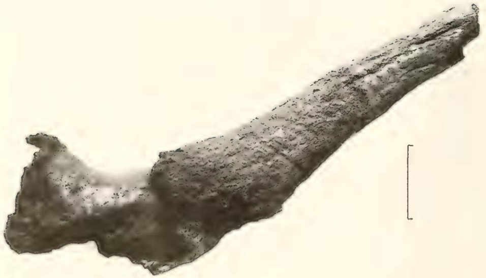
Fig. 2: Holotype right horn core of Megalotragus kattwinkeli , VI-1099, in anterior view. Scale = 5 cm.

The holotype of Rhynotragus semiticus , as seen again in 1992, corresponded to RECK's (1925, 1933 and 1935) illustrations, but had suffered damage to the ventral orbital rim and side wall of the braincase. The broken pieces have been preserved. The undamaged portion bore no number or label although both RECK (1935) and SCHWARZ (1937: 60) gave its number as VII-1111.